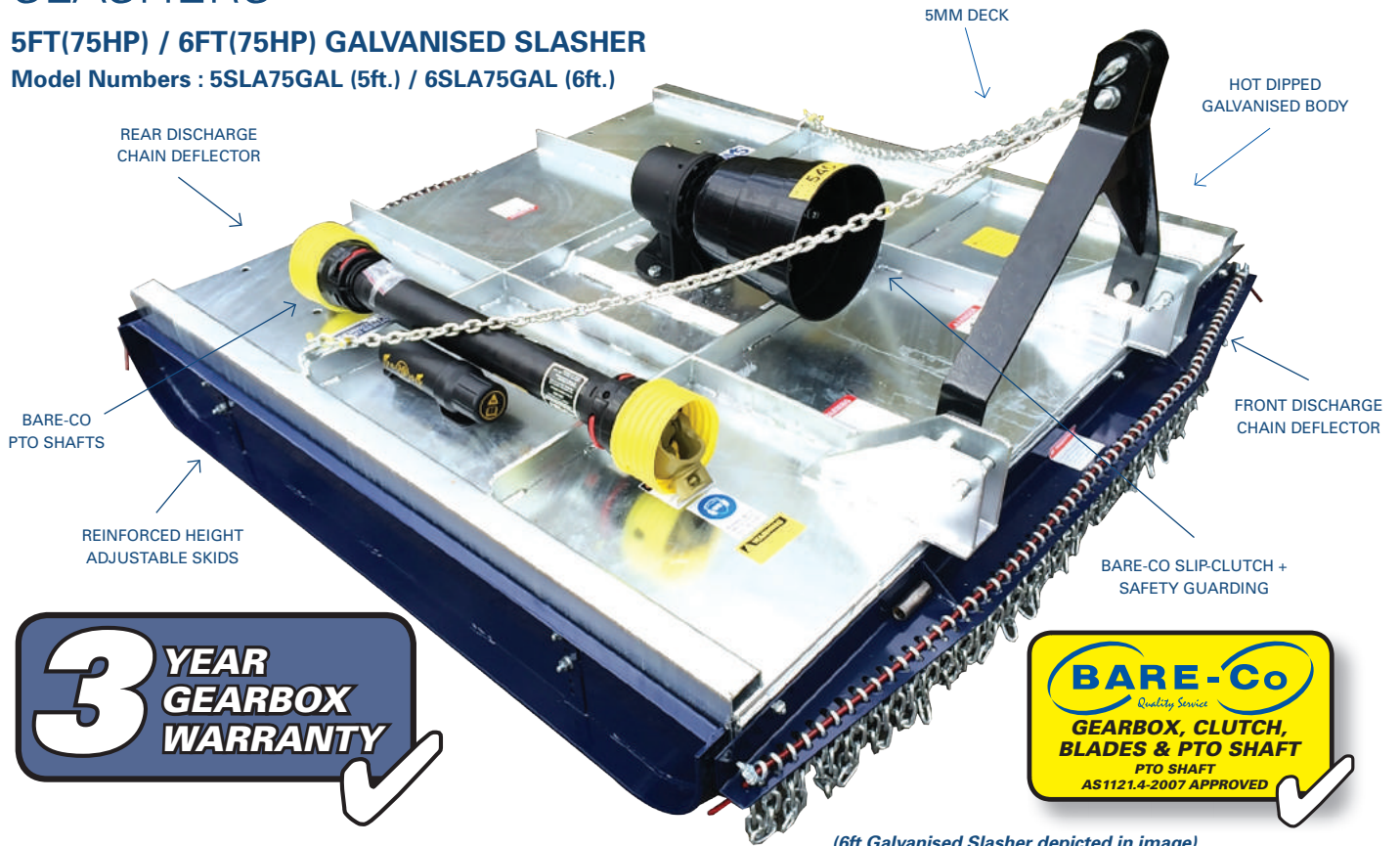
(6ft Galvanised Slasher depicted in image)

Model Numbers : 5SLA75GAL (5ft.) / 6SLA75GAL (6ft.)