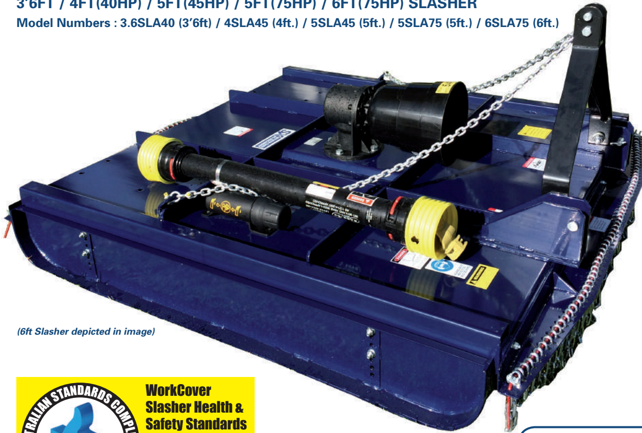
(6ft Slasher depicted in image)

Model Numbers : 3.6SLA40 (3'6ft) / 4SLA45 (4ft.) / 5SLA45 (5ft.) / 5SLA75 (5ft.) / 6SLA75 (6ft.)