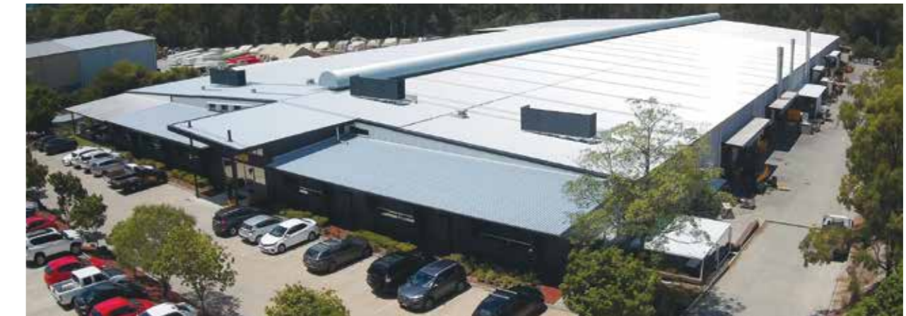
Digga's 12,500m² (130,000 sq ft) state of the art manufacturing facility, Brisbane Australia.