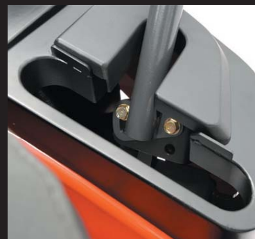
Adjustable Speed Control Levers