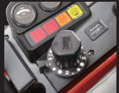
1/4" Increment Cutting Height Adjustment