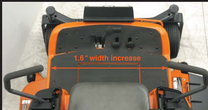
Full-Flat Operator Platform