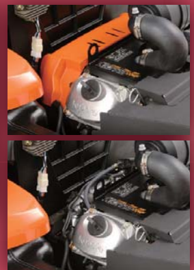
Removable Engine Cover

*When in use, consult operator manual and handle with care.