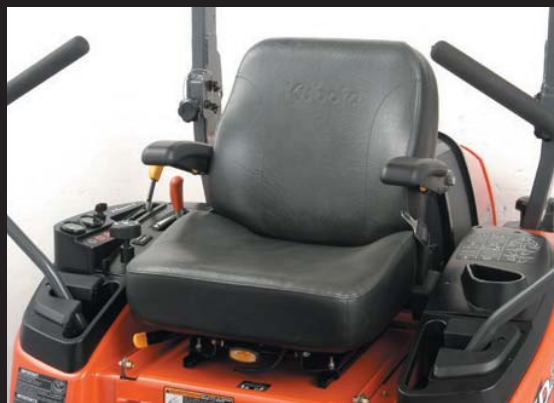
Suspension Seat Adjustment Lever