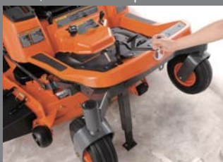
Maintenance Lift (Optional)

Maintenance doesn't get any easier. The seat panel lifts up for quick access to the HST, the hood opens for routine maintenance (adding oil, etc.), an operator platform hatch makes upper mower access a snap—and all three can be opened at once. Plus, Kubota's optional tilt-up lift feature is also available for routine maintenance underneath the mower.