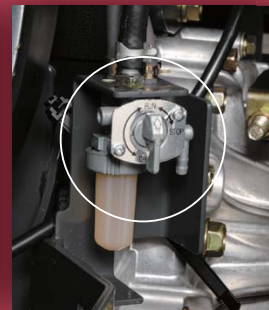
Carburetor Drain Cock*

*When in use, consult operator manual and handle with care.