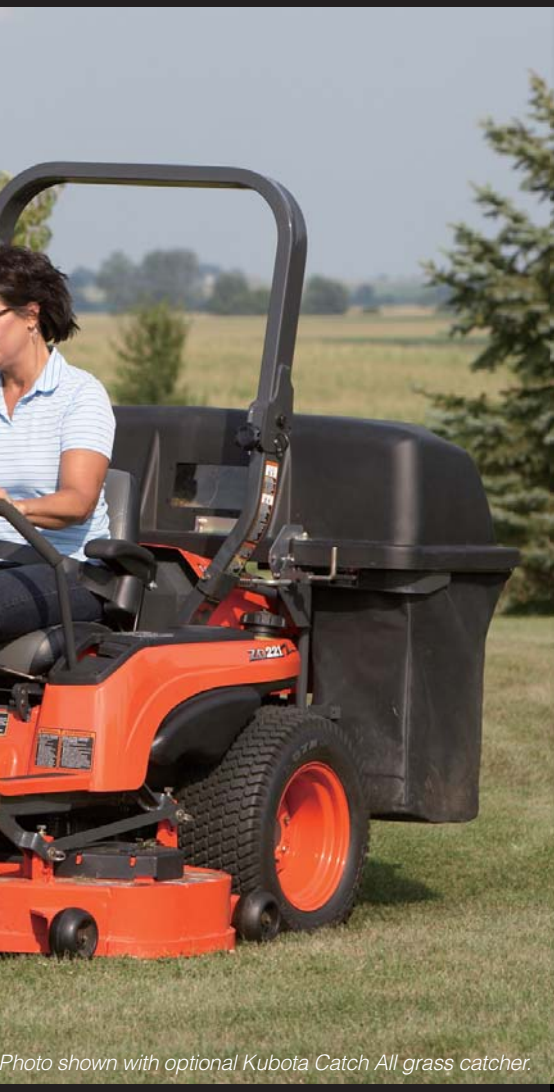
Photo shown with optional Kubota Catch All grass catcher.